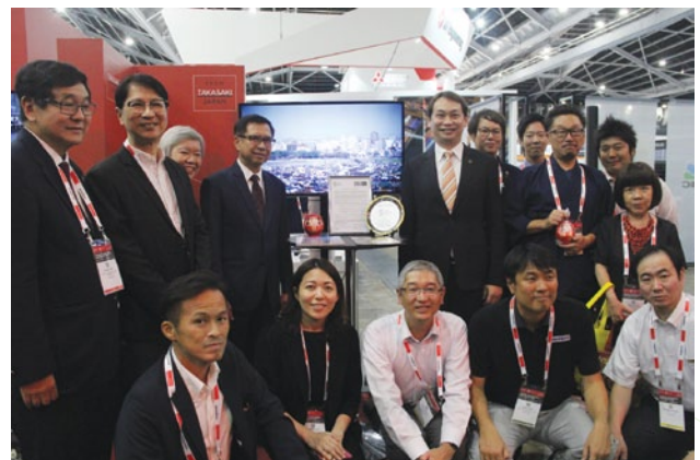
GBG organises the Singapore Pavilion at international trade fairs such as the Food Hotel Asia (FHA) 2018 and the Industrial Transformation ASIA-PACIFIC (ITAP) 2018.

With more than 800 participating companies, the trade shows and exhibitions by GBG pave the way for globalisation of business